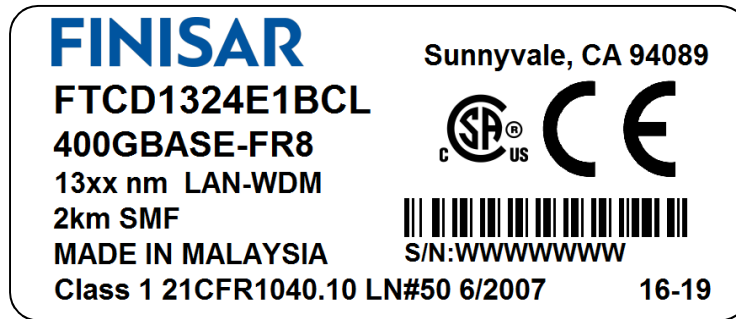
Figure 2. Standard Product Label