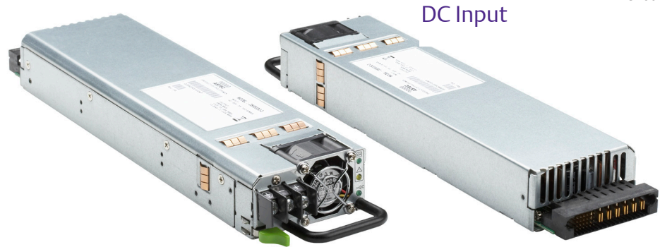
Connector input shown

Distributed Power Bulk Front-End Total Output Power: 450 - 550 Watts +12 Vdc main Output +3.3 Vdc Stand-by Output DC Input 36 - 75 Vdc