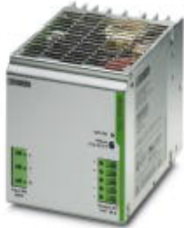
DIN rail power supply unit, primary-switched, 1-phase, input: 600 V DC; output: 24 V DC/20 A

Please be informed that the data shown in this PDF Document is generated from our Online Catalog. Please find the complete data in the user's documentation. Our General Terms of Use for Downloads are valid ( http://phoenixcontact.com/download )