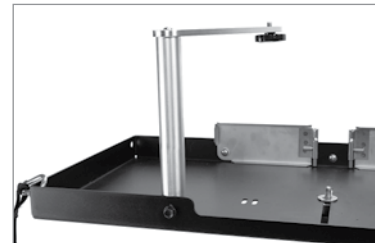
3M™ SLiC™ Fiber Splicing Workstation Cleaver Arm

3M, SLiC and Scotchlok are trademarks of 3M Company.