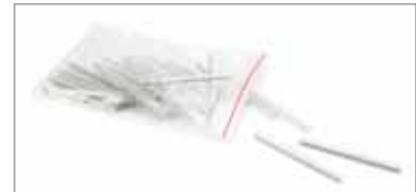
3M™ Fiber Optic Splice Sleeve 2170