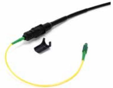
3M™ External Cable Assembly Module (ECAM) FD Factory-Terminated Fiber Drop