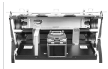
3M™ SLiC™ Fiber Splicing Workstation