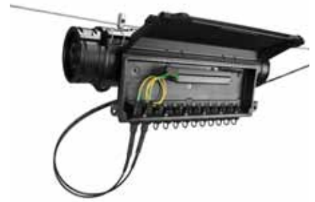
3M™ SLiC™ Fiber Aerial Terminal Closure 530 with Internal Drop Termination for Factory-Terminated ECAM FD Drop Cable

The SLiC 530 is Rural Utilities Services (RUS) Listed.