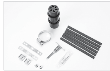
3M™ SLiC™ 6-port Grommets