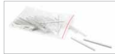
3M™ Fiber Optic Splice Sleeve 2170