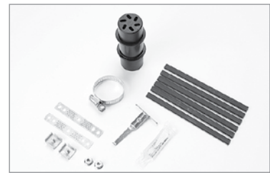
3M™ SLiC™ 6-port Grommets