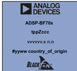
Figure 7. Product Information on Package 1

The information presented in Figure 7 and Table 27 provides details about package branding. For a complete listing of product availability, see the Ordering Guide.