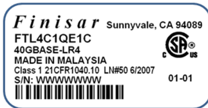
Figure 3 – FTL4C1QE1C production label