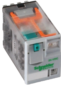
792 Full-Feature Cover