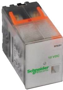
792 Clear Cover

UL listed when used with proper Magnecraft sockets