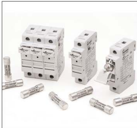
Insert Class CC fuse with the rejection feature facing the top.