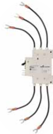
Programmable Logic Controller (PLC)