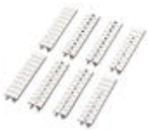
Zack marker strip, Can be ordered: Strip, white, Labeled according to customer specifications, Mounting type: Snap into tall marker groove, For terminal block width: 5.2 mm, Lettering field: 5.15 x 10.5 mm