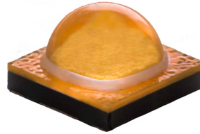
XP-G2 High Efficacy LED