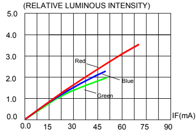
FIG.2 RELATIVE LUMINOUS INTENSITY VS. FORWARD CURRENT