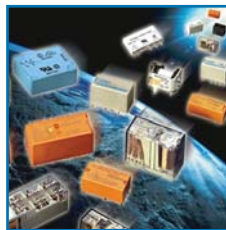
Schrack PCB Relays