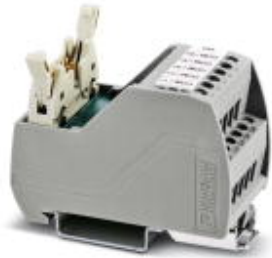
VARIOfACE Professional (VIP) board for the ROC800 controller

Please be informed that the data shown in this PDF Document is generated from our Online Catalog. Please find the complete data in the user's documentation. Our General Terms of Use for Downloads are valid ( http://phoenixcontact.com/download )