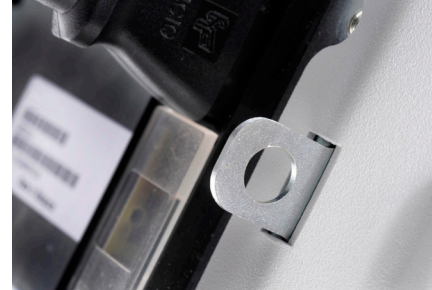
Physical lock mechanism as illustrated

Essential security features: Over-voltage protection (OVP)/ Over-current protection (OCP), keypad lock and physical lock mechanism