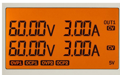
Figure 2. Backlight on/off feature with dual reading (voltage and current) on an LCD display