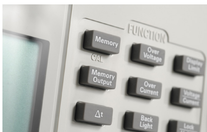
Figure 1. Output sequencing made easy with intuitive keypads

Both models of the U8030 series come with a set of features to suit your needs while remaining easy to use. The LCD screen displays both voltage and current readings in a one-view panel while the all ON/OFF button allows multiple outputs to be controlled simultaneously. Additionally, the auto-track feature simplifies setup between output 1 and output 2. With these, you get a solid bench power supply plus a set of convenient and easy to use features.