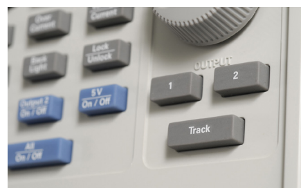
Figure 3. Simplifies Output 1 and Output 2 setup with tracking feature