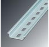
DIN rail 35 mm (NS 35)

DIN rail - NS 35/ 7,5 WH PERF 2000MM - 1204119