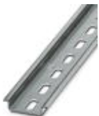
DIN rail, material: Galvanized, perforated, height 7.5 mm, width 35 mm, length: 2 m

DIN rail - NS 35/ 7,5 ZN PERF 2000MM - 1206421