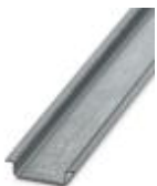
DIN rail, material: Galvanized, unperforated, height 7.5 mm, width 35 mm, length: 2 m

DIN rail - NS 35/ 7,5 ZN UNPERF 2000MM - 1206434