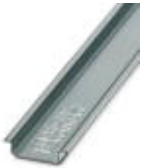
DIN rail 35 mm (NS 35)

DIN rail - NS 35/ 7,5 WH UNPERF 2000MM - 1204122