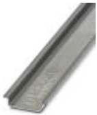
DIN rail, unperforated, Width: 35 mm, Height: 7.5 mm, Length: 2000 mm, Color: silver

DIN rail, unperforated - NS 35/ 7,5 AL UNPERF 2000MM - 0801704