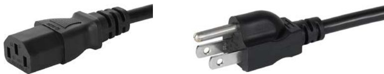
Power plug Japan black