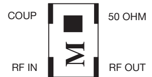
Type: A Sub-Type: B