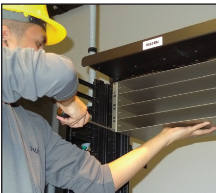
A single installer can install the system.

A standard sliding module tray brings the work platform out of the rack and at a 23 degree tilt down toward the installer to improve accessibility during installation. A quickly installed lid and front patch cord tray provides unprecedented visibility to the work at hand. Improved accessibility and visibility leads to fast, clean, error-free installation.