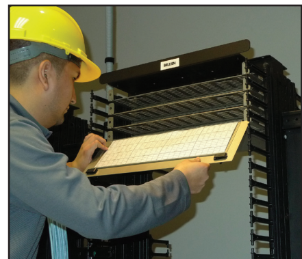
Shelf identification labeling is clearly visible.