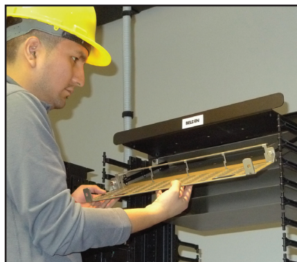
Slide-in trays tilt outward to improve accessibility.