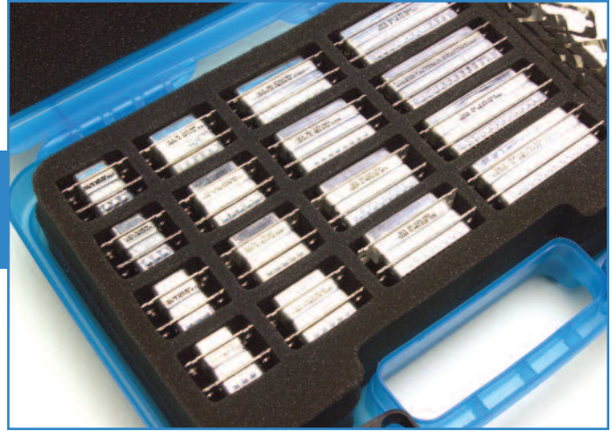
Adapter Test Kit