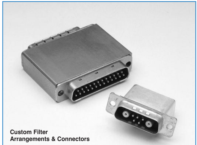
Custom Filter Arrangements & Connectors