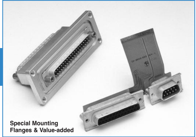
Special Mounting Flanges & Value-added