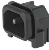
IEC connector C14 or C18 Screw-on mounting PCB Mounting