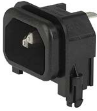
Snap-in version Sandwich/rear-side PCB Mounting