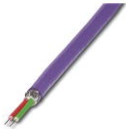
PROFIBUS cable, Fast Connect type, up to 12 Mbps (02YSY (ST)CY 1x2x22 AWG)

Please be informed that the data shown in this PDF Document is generated from our Online Catalog. Please find the complete data in the user's documentation. Our General Terms of Use for Downloads are valid ( http://phoenixcontact.com/download )