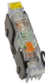
Table 4. Class R fuse block catalog numbers