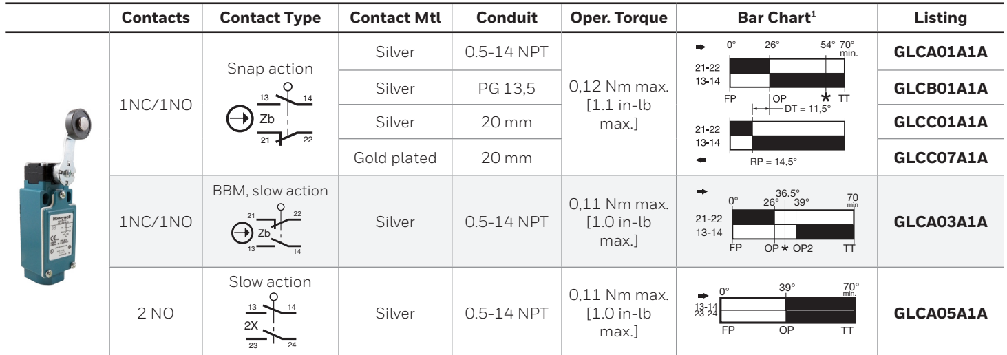
Table 3. Side Rotary, Plastic Roller

1 Contact closed ■; Contact open □. *Positive opening occurs.