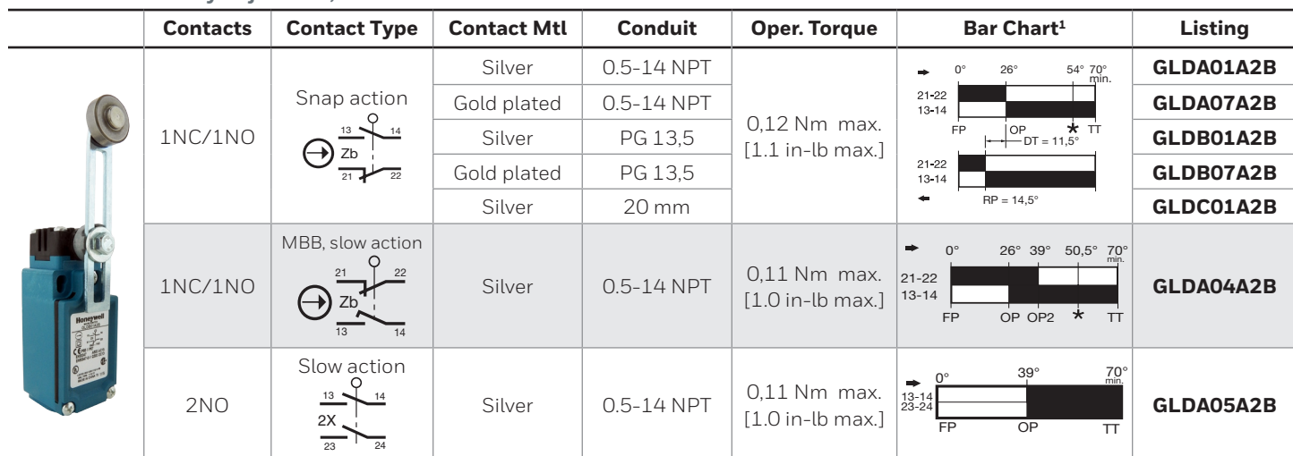
Table 19. Side Rotary Adjustable, Metal Roller