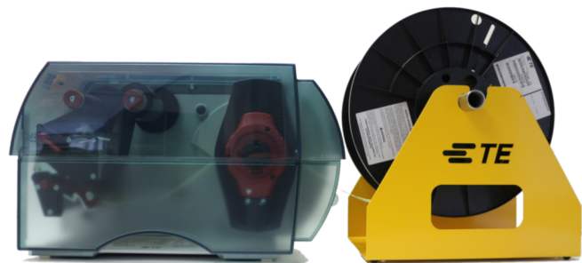
TE3112 with Universal reel holder