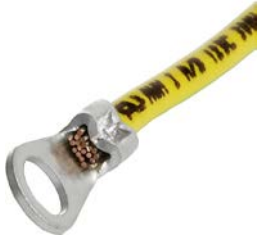
Wire Harness Wire harness for SCHURTER products