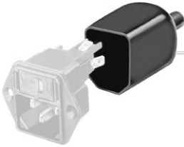
Assorted Covers Rear Cover