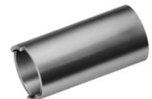
AT112 Socket Wrench