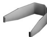
AT109 Cap Extractor

Actuator must be in UP position. Pull off cap with cap extractor AT109. Replace lamp and reassemble as shown above.