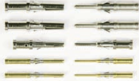
2, 3, 8, 16 & 22 pole contacts