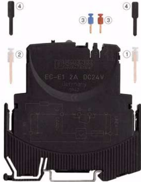
Figure 5 Structure (using example of EC-E1)