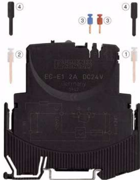
Figure 5 Structure (using example of EC-E1)