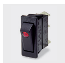
C5503PL - - -