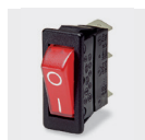
C5503AL - - -