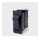
C5500AL - - -