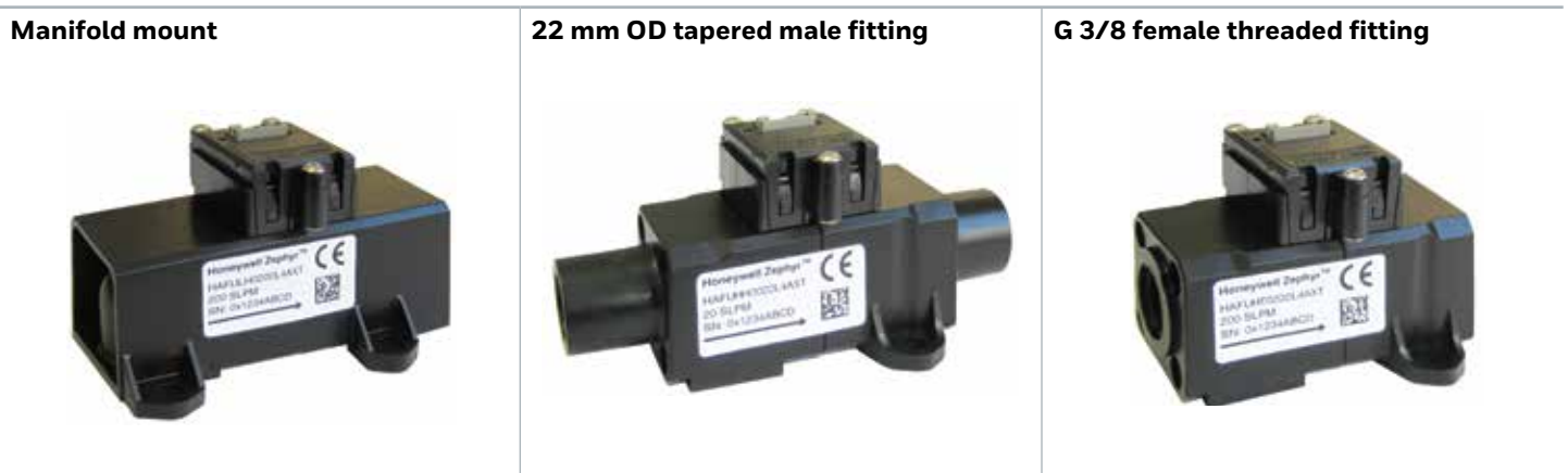
Figure 3. All Available Standard Configurations

1 Apart from the general configuration required, other customer-specific requirements are also possible. Please contact Honeywell.