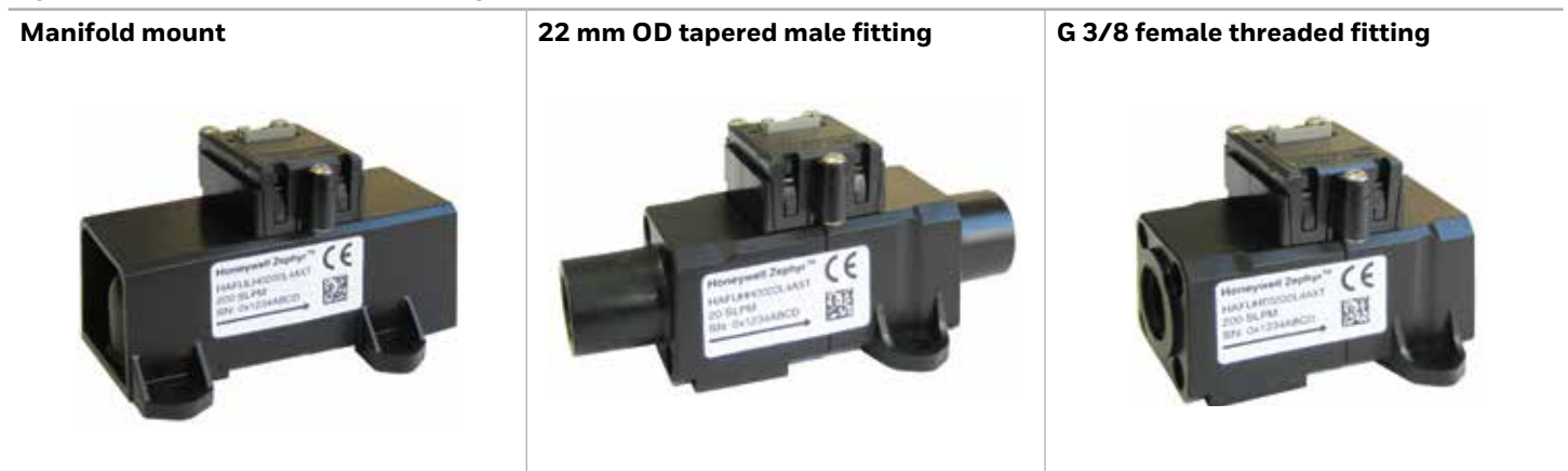
Figure 3. All Available Standard Configurations

1 Apart from the general configuration required, other customer-specific requirements are also possible. Please contact Honeywell.