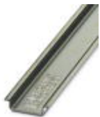
DIN rail, material: Steel, unperforated, height 7.5 mm, width 35 mm, length: 2 m

DIN rail - NS 35/ 7,5 UNPERF 2000MM - 0801681