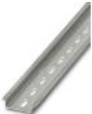
DIN rail, material: steel galvanized and passivated with a thick layer, perforated, height 7.5 mm, width 35 mm, length: 2000 mm

DIN rail perforated - NS 35/ 7,5 PERF 2000MM - 0801733