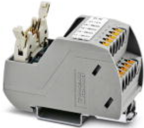
VARIOFACE Professional (VIP) board for the ROC800 controller

Please be informed that the data shown in this PDF Document is generated from our Online Catalog. Please find the complete data in the user's documentation. Our General Terms of Use for Downloads are valid ( http://phoenixcontact.com/download )