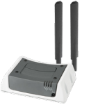
LTE Connectivity Kit