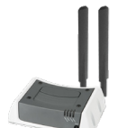
LTE Connectivity Kit