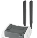
LTE Connectivity Kit