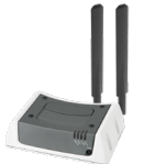
LTE Connectivity Kit