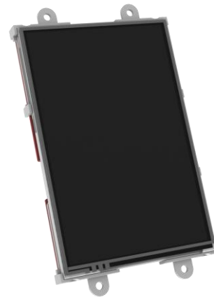
The uLCD-35DT Display Module