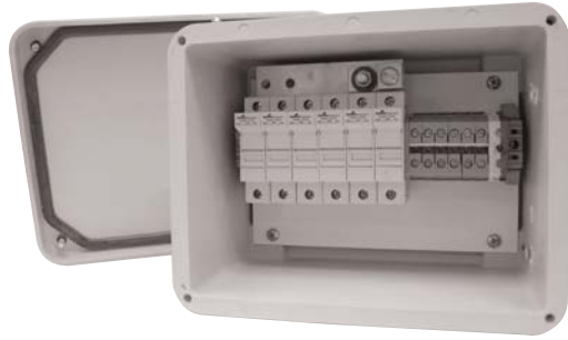
BCBC Series Compact Box