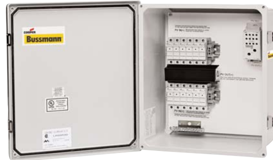
BCBS Series Standard Box