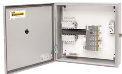
BCBD Series Integrated Disconnect Box