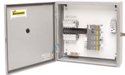
BCBD Series Integrated Disconnect Box