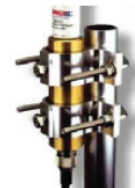
FM2 Mounting Kit (Sold separately)

Americas: +1.847.839.6925 IAS-AmericasSales@lairdtech.com