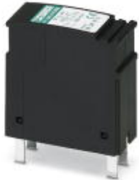
Protective plug PT with HF protective circuit for 4 signal wires. Nominal voltage: 5 V DC

Please be informed that the data shown in this PDF Document is generated from our Online Catalog. Please find the complete data in the user's documentation. Our General Terms of Use for Downloads are valid ( http://download.phoenixcontact.com )