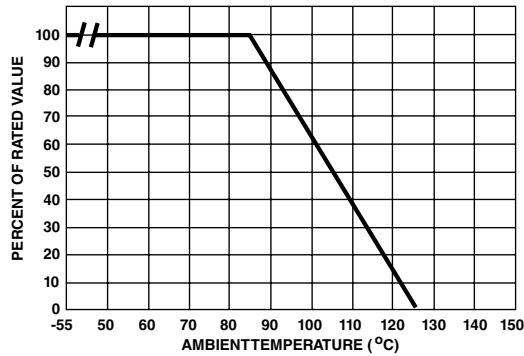
Figure 1B - Power Derating for Phenolic Coated

For applications exceeding 85°C ambient temperature, the peak surge current and energy ratings must be reduced as shown below.