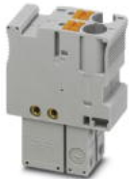
Plug, 2-pos. with integrated, automatic short circuit function

Please be informed that the data shown in this PDF Document is generated from our Online Catalog. Please find the complete data in the user's documentation. Our General Terms of Use for Downloads are valid ( http://download.phoenixcontact.com )