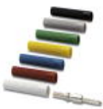
Insulating sleeve, Color: red