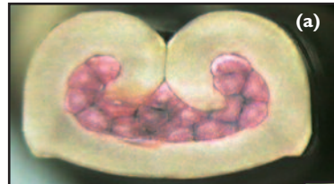
Cross Sections Showing Minimum (a) and Maximum (b) Area Index per Terminal Specification—a Variation of \pm 3.5\%

Therefore, varying the CW by 2% would result in a CH variation of 2%, or 0.0014 in. At a CH tolerance of \pm 0.002 in, 35% of the total CH tolerance would be used by a 2% variation in CW. Thus, the importance of crimp width control is obvious when tooling is changed during a production run.