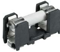
OGN-SMD equipped with fuse