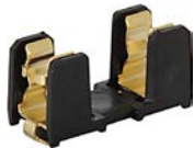
OGN-SMD for increased solder temperature with gold contacts